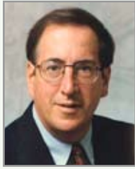
J. William Springer Chair